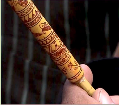
The 'Pipe' with rich detail was sold for rs.5/-

No doubt electric pyro-graphic tool, when it is available, offers more possibilities even with local images as seen in bambu studio at idc!