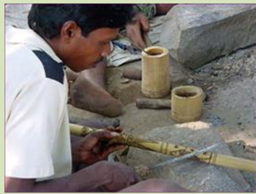
burning images with heated tool

We came across similar pyrography done on a 'Pipe for smoking' in Meghalaya as well.