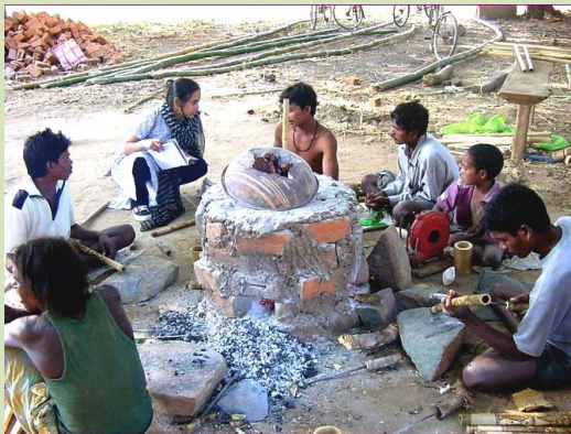
Furnace used by group in Chattisgarh

It had its own context where the craft persons were using local technique with a wrought iron tool heated in a small furnace connected to a hand blower. Coal was the fuel. We soon found out that 'pyrography' is more effective if skin of bamboo is retained as fine lines can be ingrained because of the 'Silica content'.